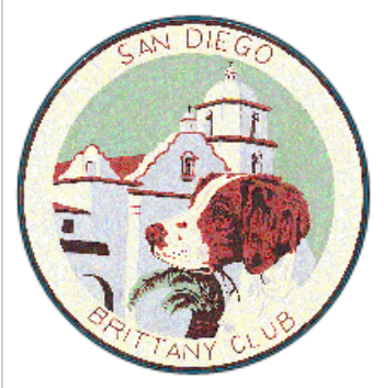
San Diego Brittany Club