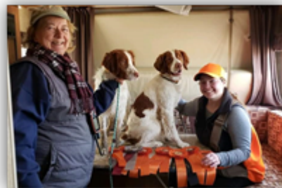
Wallace & Brody