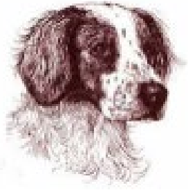
California Brittany Club