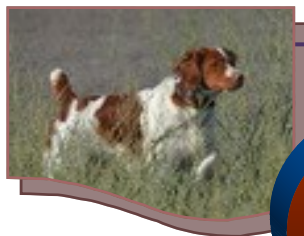
DUAL DOG RIVER