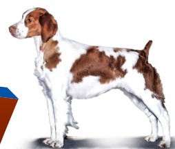
SHOW DOG CRYSTAL