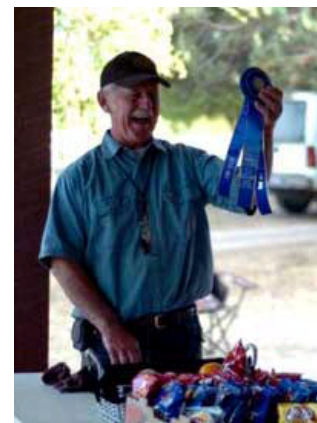
"And the Winner is..."