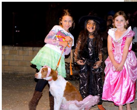
Are we having fun yet?