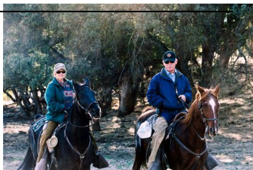
The "PD" Team