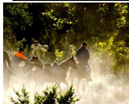
Where'd the Rider go?