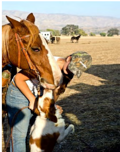
A Kiss for Good Luck