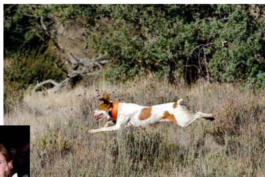
Flyin' Like a Bat Outta H _ _ _