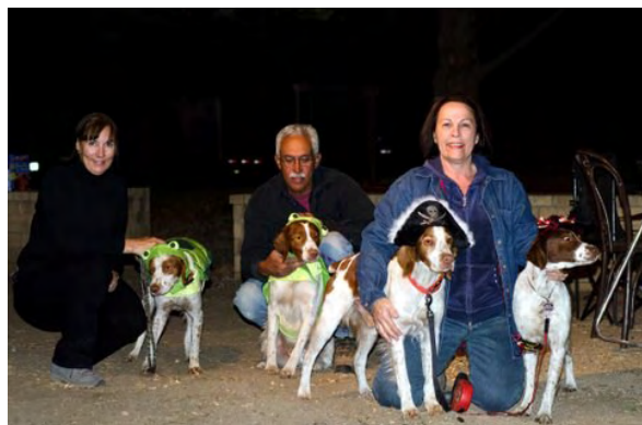
OK...Who's your Daddy?