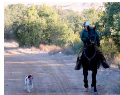
"Come On...Just a little farther."