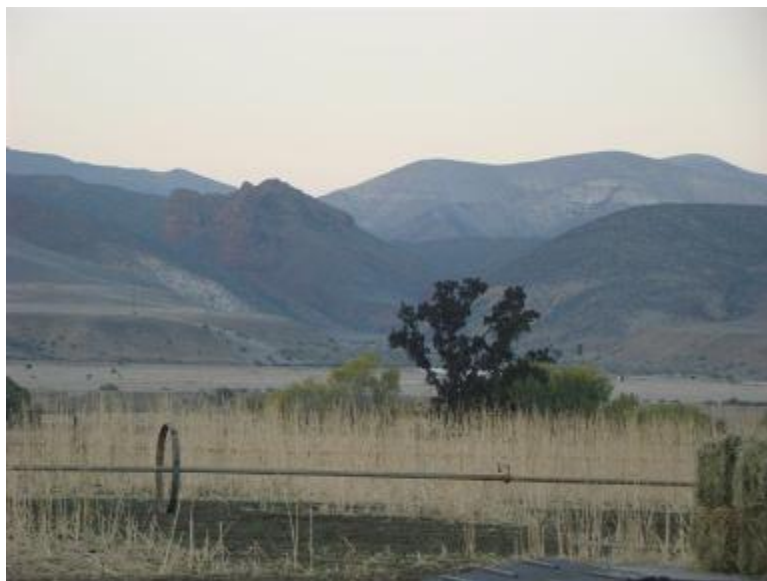
Special thanks to Dan and Pam Doiron for allowing us to host our Fall Field trial at El Rancho Espanol de Cuyama. What a splendid setting it was!

The course meandered through Kelly Canyon, which had oak trees, small pine trees and other scrub dotting the sides of the canyon. Dogs and horses made their way over a course that zig-zagged its way across rock-strewn dry river beds up the canyon to several cattle water troughs. The going was slower than what we normally have experienced, but the dogs had no problem finding birds and stretching their runs up the canyon walls.