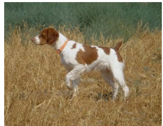
Midas Blazin Amber Skies

Midas Blazin Amber Skies took 1st place in Am Gun Dog at the CBC Fall Trial winning a 3 point major. She also took 1st place in Am Gun Dog at the Northern Nevada Spring Trial for another point toward her field championship.