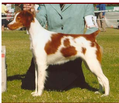
Castle's Sleeping Beauty Zoei 5 point major