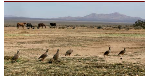
Covey of Chukar stayed in camp the entire weekend.