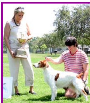
Best Opposite Sex Vegas

gram and I must say that she impressed us with her unselfish help with not only the Juniors, but of the Novice handlers. She really knew her stuff.