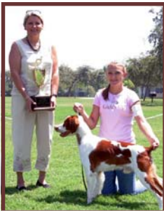
Trop Grand Booker

would be fun to have a special class for them. It was called "Trop