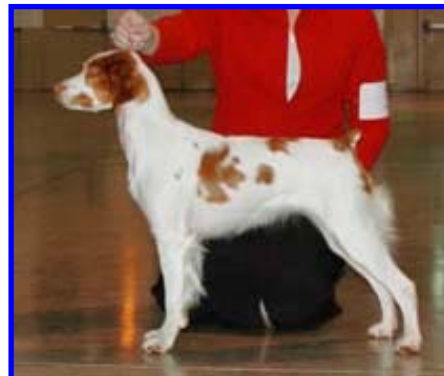
1st Money Bitch & BOS ALMADEN'S LONE SHADOW DANCER