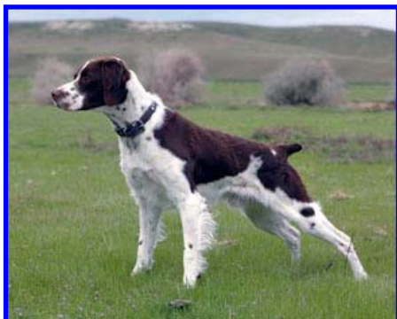
2nd Money Dog & DUAL DOG MEGA CHIP