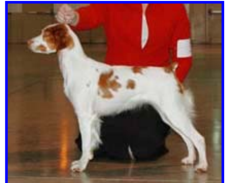
1st Money Bitch & BOS ALMADEN'S LONE SHADOW DANCER