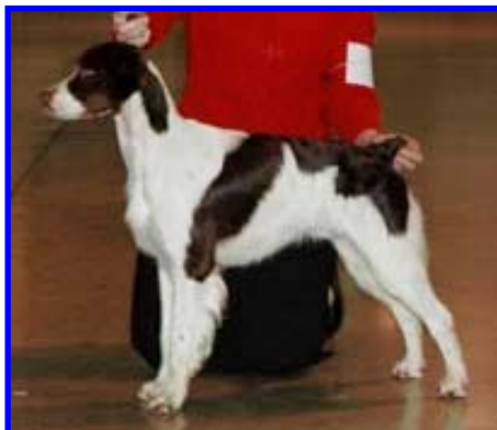
1st Money Dog & BEST OF BREED ALMADEN'S RIVER OF SHADOWS