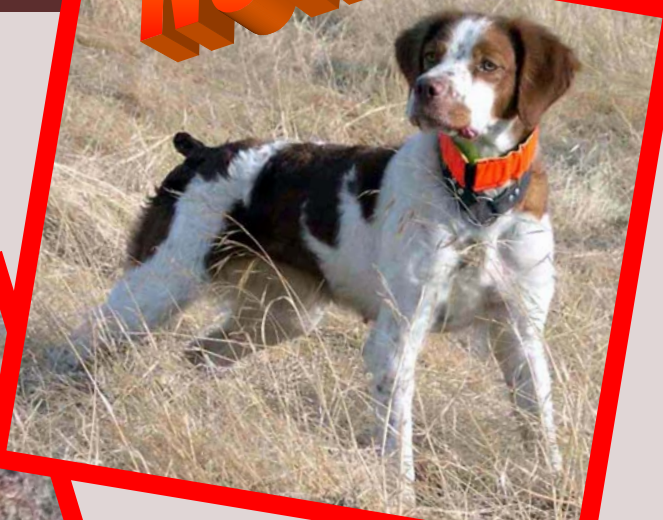
DC TJ'S SINGLE SHOT OF SCIPIO OWNED BY TOM WHITE & MARGARET HORSTMAYER