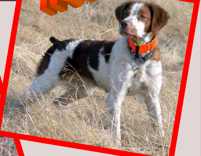
DC TJ'S SINGLE SHOT OF SCIPIO OWNED BY TOM WHITE & MARGARET HORSTMAYER