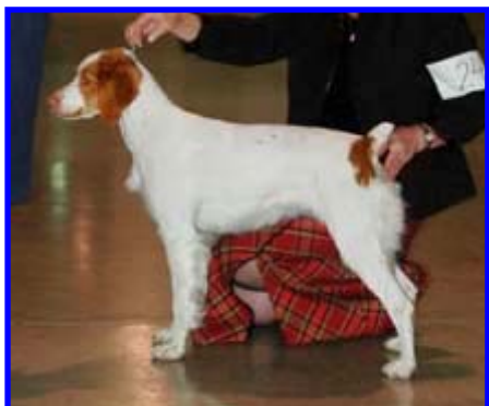
2 nd MONEY BITCH WOLRAM'S MOVING GLACIER