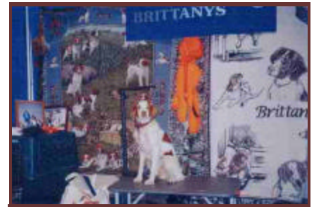
Chief in the Brittany Booth