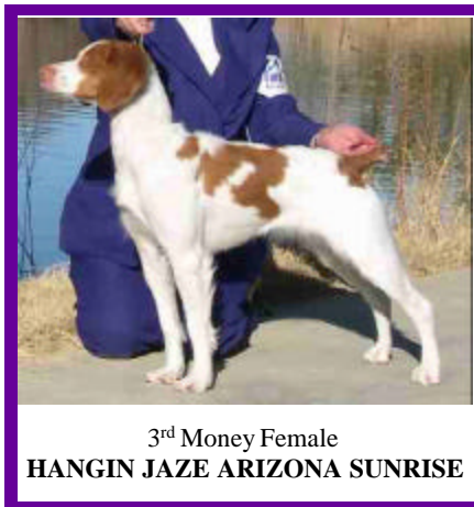
3 rd Money Female HANGIN JAZE ARIZONA SUNRISE