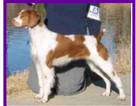
1 st Money Female & Best in Futurity LONE OAK'S SOVERIGN DELTA

game. Bess took off with excellent range, running hard into the wind with snappy moves, taking to the hills. She had 2 finds to her credit, and feeling good in the weather, she was a little hard to handle but excelled in all other aspects.