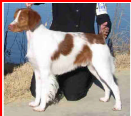
1 st Money Male & BOS CASTLE'S TANGERINE DREAM