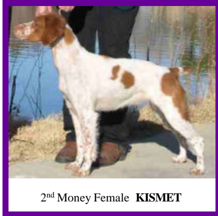
2 nd Money Female KISMET