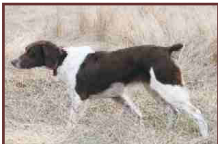
Shiloh's Whoa Nellie, JH is now a Senior Hunter!