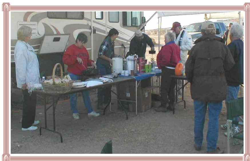
Breakfast was made and was such a success that it will be done again at the Spring trial.