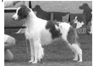
Best of Winners FIRST TIME FLYER "Rookie"