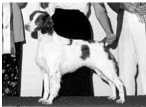
Best of Opposite Sex CH Burford's Just In Kase "KC"