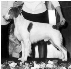
Best of Breed DC Roja's Gambling Chips "Vegas"